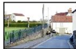
9. The same scene as 8 showing the remains of the Mill buildings