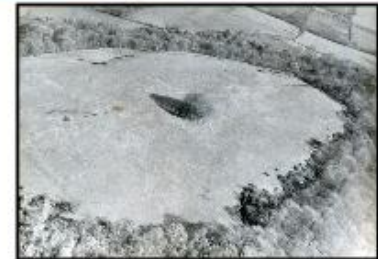
13. Iron Age Camp above the wood at Towerhead.