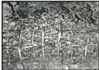
1. Eighty thousand year old bones, stacked in Banwell Bone Cave.