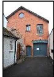
6. The Malthouse that belonged to Banwell Brewery