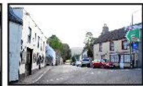
19. East Street as it is today, without the Square that had once had a village cross, all completely disappeared.

Acknowledgements: This unit was paid for by the Kathleen Jones Family Charity.