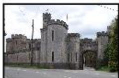
7. Banwell Castle build as a private home in 1847