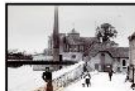
8. Banwell Pond with brewery and mill buildings in 1894. The mill ran from medieval times up to 1921. Before it was a brewery it was a paper mill from the late 1700's till 1850, the brewery rand from 1850 to 1906.