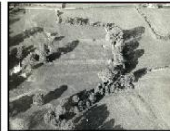
12. Roman-British site at Winhill where the famous roman glass bowl was found in 1956 The bowl is now in the Ashmolean Museum in Oxford.