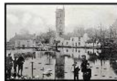
10. The pond as it was up until 1921 when the mill stopped working. The water and rights had been sold to Bristol Water Works in 1909.