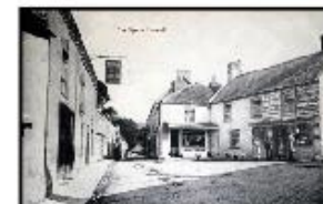
18. The square and East Street as it was until 1965 when the south side was pulled down to ease traffic congestion.