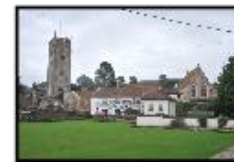
11. The pond area now as a bowling green, after the pond was filled in was planted with trees and bushes before the bowling club took it over in 1934.