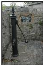
5. The 1887 Jubilee pump in High Street, which is 76ft deep