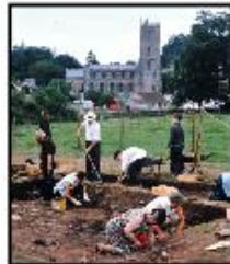
2. Excavation at a Roman site discovered in Ten Acre field in 1967