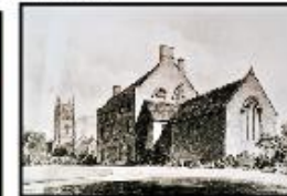
14. The Bishops of Bath & Wells Manor House drawn by Buckler in 1827 when it was leased to a local gentleman farmer.